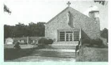
Saint Peter New Haven, IA