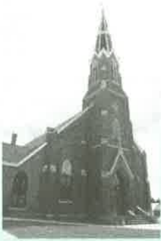
Our Lady of Lourdes Lourdes, IA