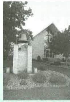
Immaculate Conception Riceville, IA