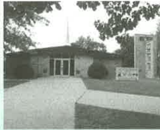
Immaculate Conception Elma, IA