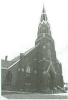
Our Lady of Lourdes Lourdes, IA