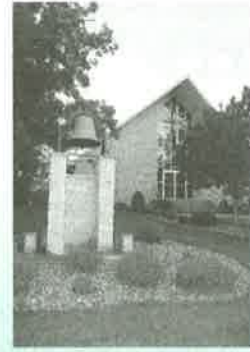
Immaculate Conception Riceville, IA