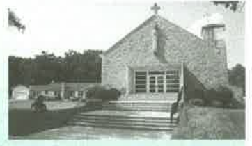
Saint Peter New Haven, IA