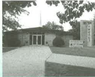
Immaculate Conception Elma, IA