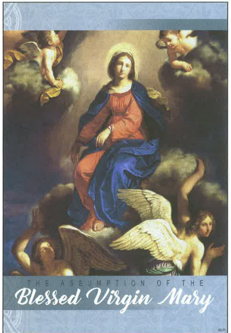
THE ASSUMPTION OF THE Blessed Virgin Mary