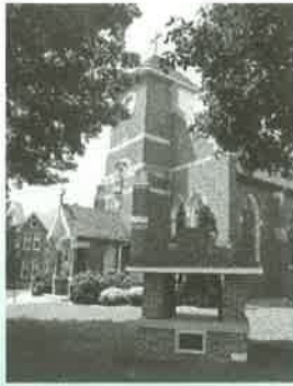
Saint Bernard Alta Vista, IA