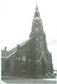
Our Lady of Lourdes Lourdes, IA