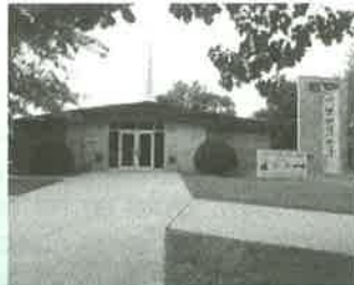
Immaculate Conception Elma, IA