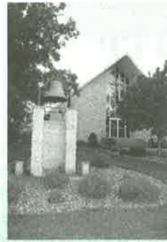
Immaculate Conception Riceville, IA