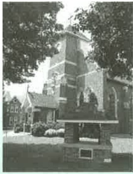
Saint Bernard Alta Vista, IA